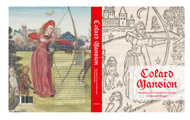
For sale at Museumshops Groeningemuseum & Arentshof, Dijver 16, 8000 Brugge