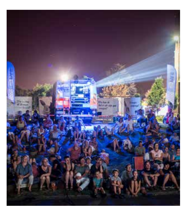
Take-over MOOOV