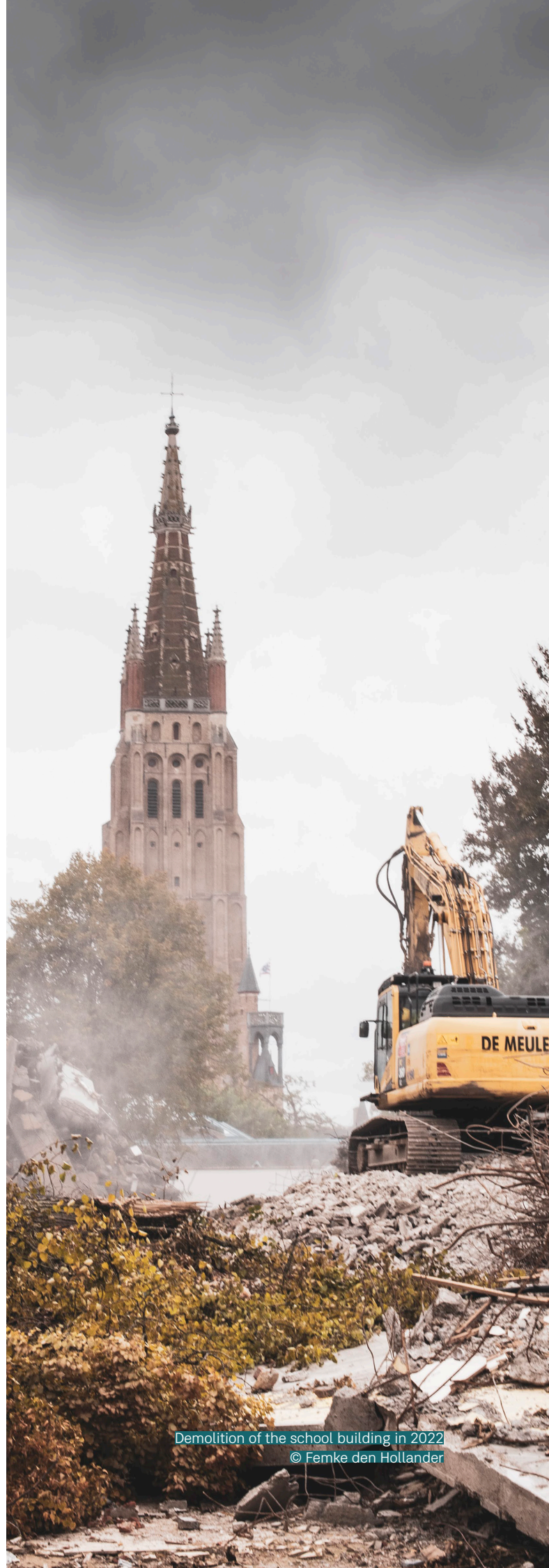
Demolition of the school building in 2022