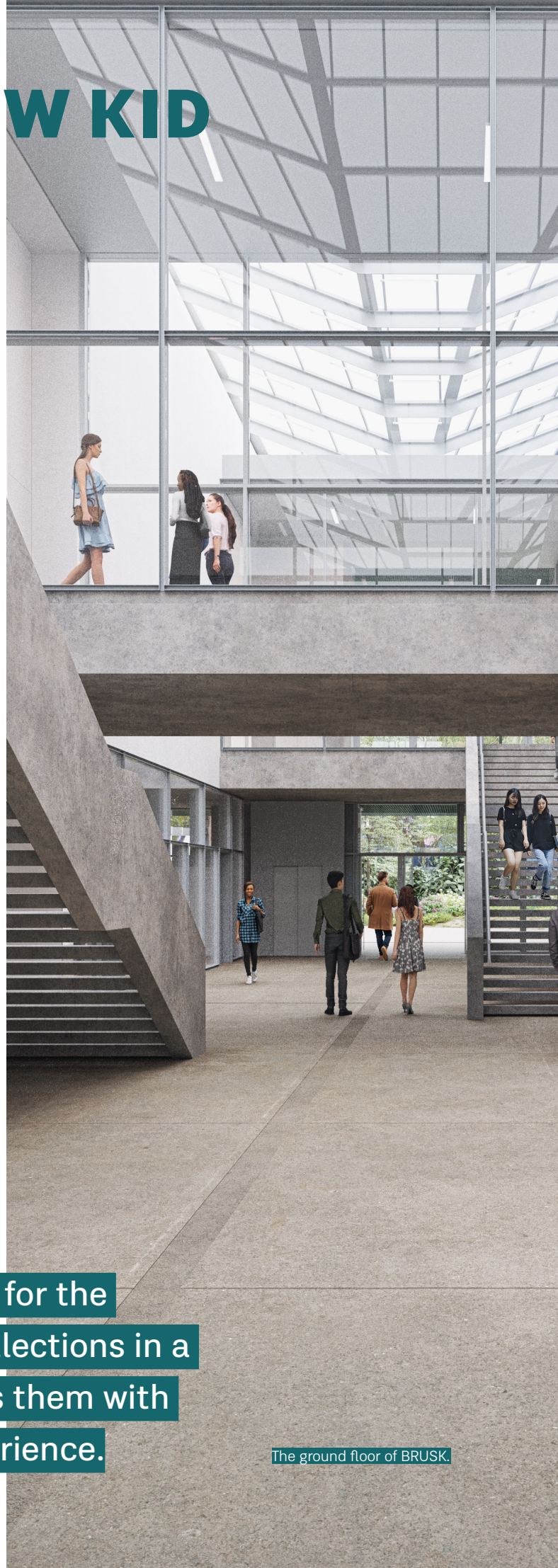
The ground floor of BRUSK.

BRUSK will become the place for the display of our magnificent collections in a progressive manner that links them with a contemporary cultural experience.