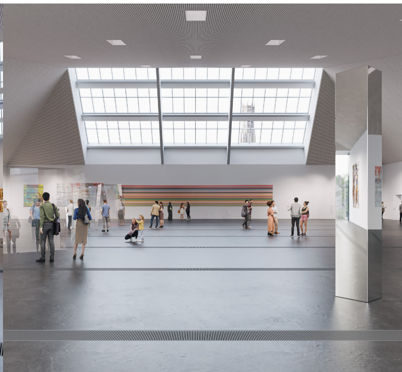
A view of the city with BRUSK.